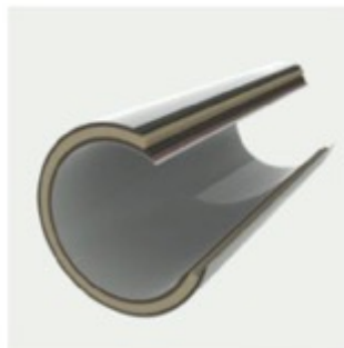
GRP Pipe Wall Layers

Please contact your local Clover office for further assistance.