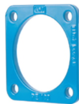
ABR125 ANT DI Backing Ring DN125 PN16