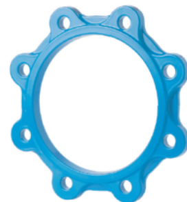
ABR180 ANT DI Backing Ring DN180 PN16